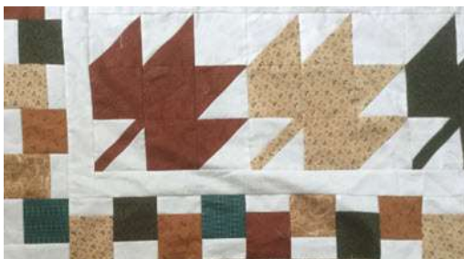
part of the pieced border