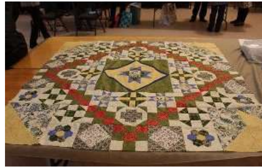
Laying out blocks for the hospital auction quilt!