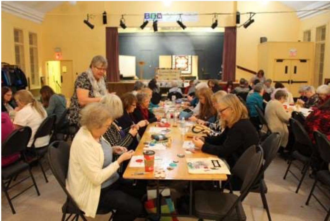
Enjoying our Learning activity evening!