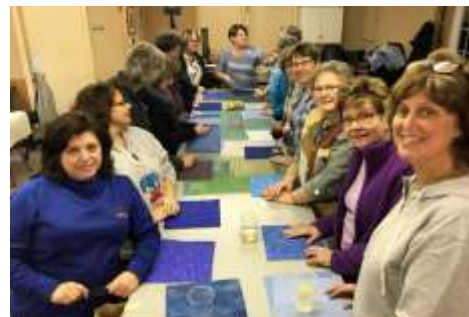
Smiles at the Lanark Retreat