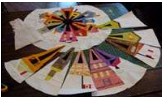
Our raffle quilt in progress