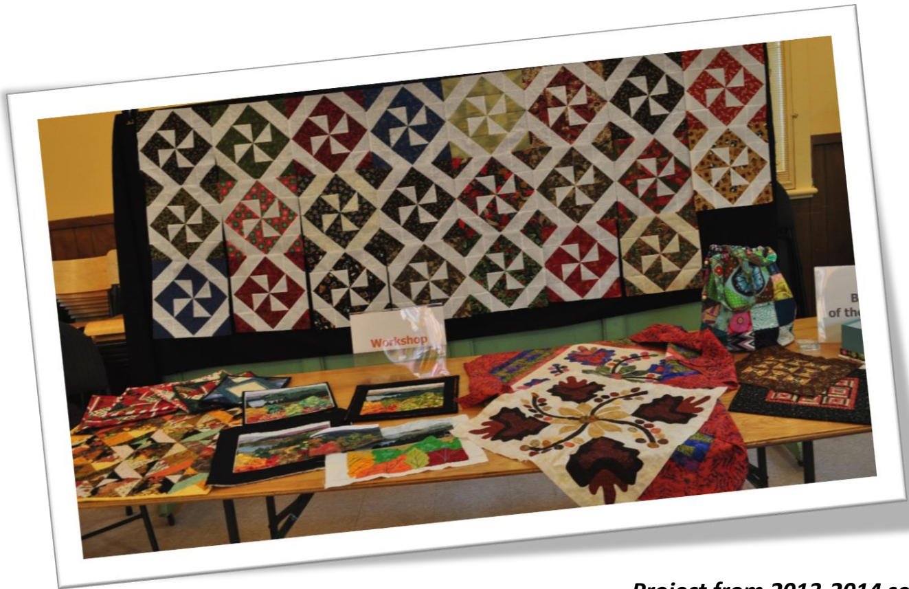
Project from 2013-2014 season