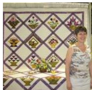
Winner of the Raffle Quilt