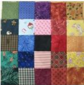
10 ½" Bingo Block

Each fabric to be chosen from one of the following categories – batik, floral, leaf, heart, geometric, metallic, holiday, novelty, paisley, plaid, solid, star, stripe, or 1930's print